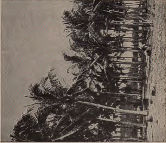
The grove at the swimming beach